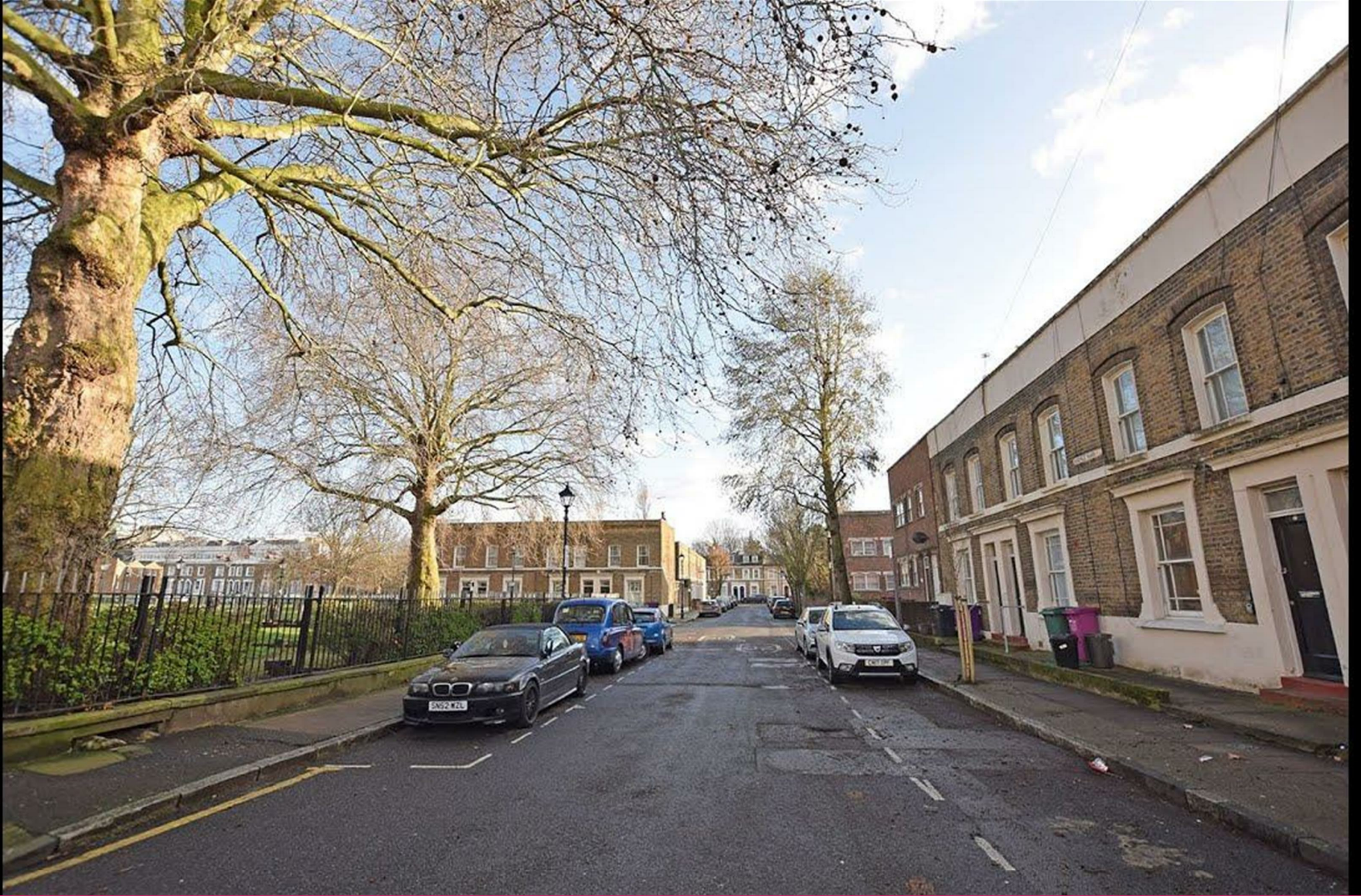
Argyle Road, London, E1